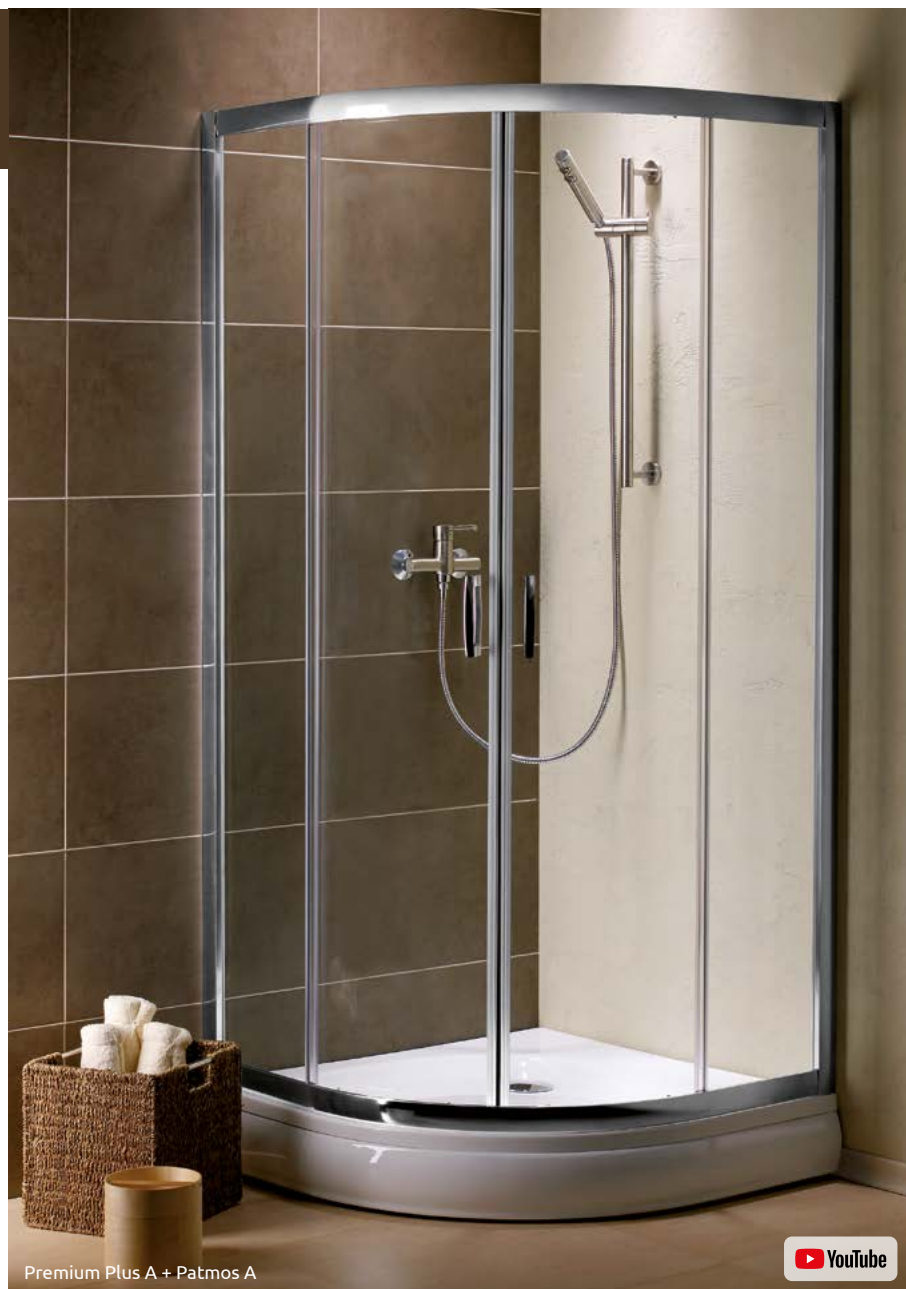
Premium Plus A + Patmos A